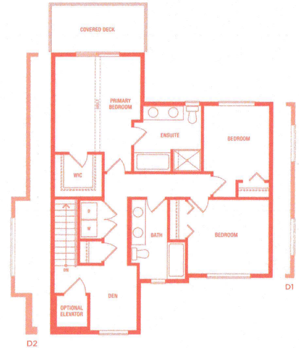
UPPER 908-946 SQFT

The developer reserves the right to make modifications and changes to the building design, elevations, dimensions, specifications, features and prices without prior notification. Decks, patios, stairs and windows may vary based on site conditions. All sizes and dimensions are approximate and based on architectural measurements. Reverse and/or mirror plans occur throughout the development. Please see disclosure statement for specific offering once available. E & O.E.